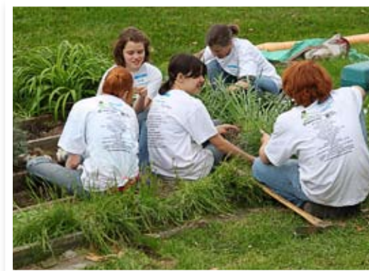
Rebuilding Together Howard County